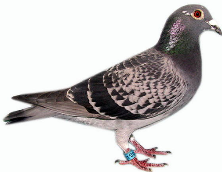
Photo of SA 07 13421 BCH

Grange is a beautifully balanced hen whom I have had the pleasure of handling on a few occasions. She is a small to medium apple bodied hen who is all class, if you didn't know her feats on the racetrack you would just on looks and handling would pick her as a top hen. She has a unique colouring a bit like a strawberry Mealy but a richer red in colour. Prior to Alice Springs she was in magnificent order showing all the signs of fitness.